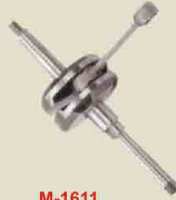
M-1611 Crank PGT Assembly