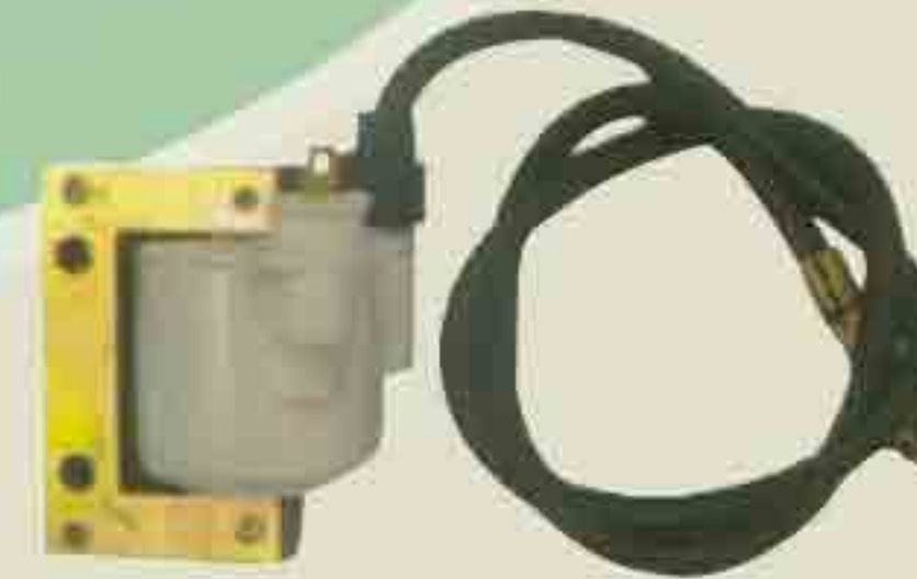
M-1761 Ignition Coil MBK/PGT