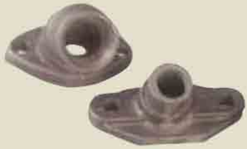
M-1591 M-1592 Admission Pipe