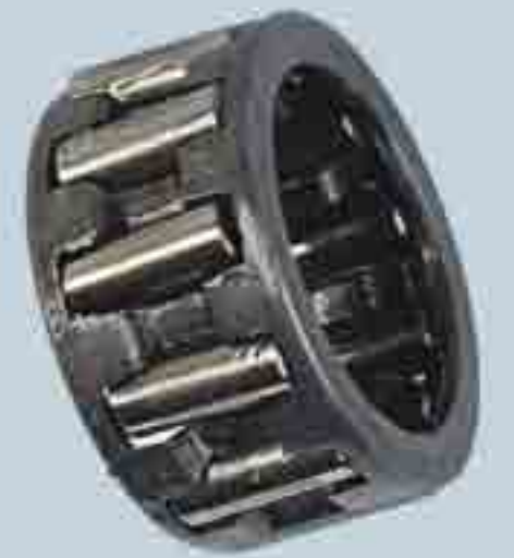
M-1703 Connecting Rod Bearing PGT