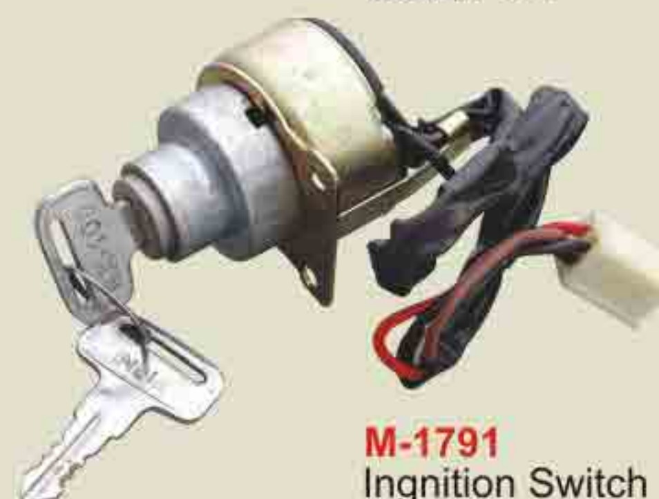
M-1791 Ignition Switch