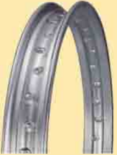
M-1666 Moped Rim