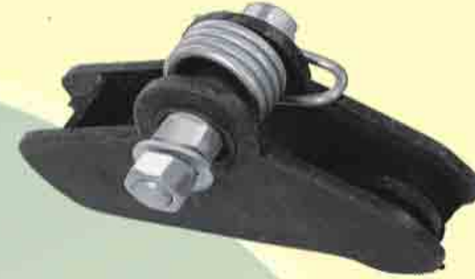
M-1651 Chain Tensioner Plastic PGT