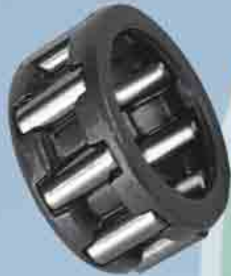
M-1705 Connecting Rod Bearing MBK