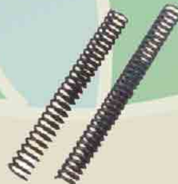
M-1751 Shocker Spring