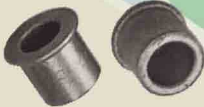
M-1741 Pedal Axle Bush