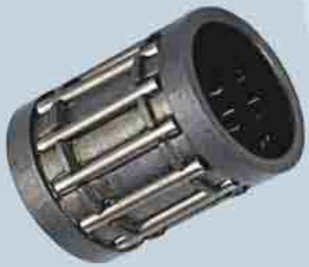
M-1704 Piston Bearing PGT