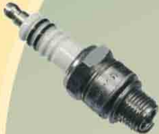
M-1671 Spark Plug