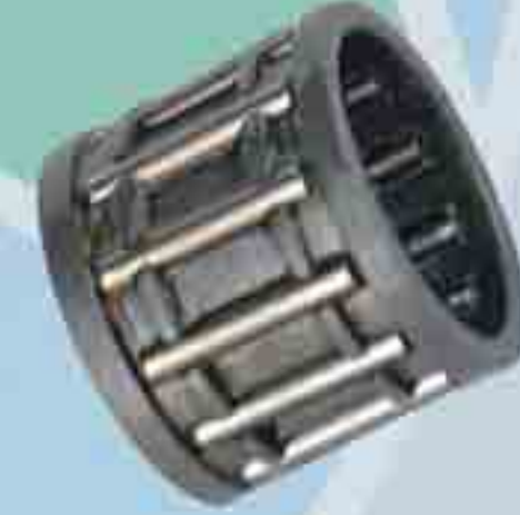
M-1707 Piston Bearing MBK