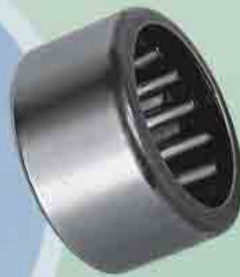
M-1701 Pulley Bearing PGT/MBK