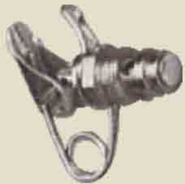
M-1731 Decompressor MBK/PGT