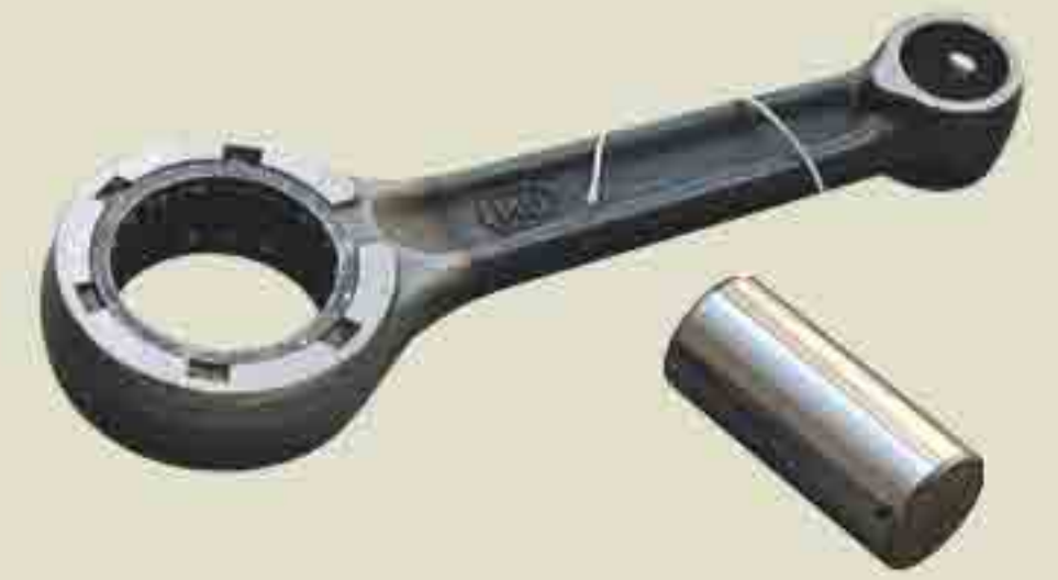
M-1631 Connecting Rod W/G. Pin