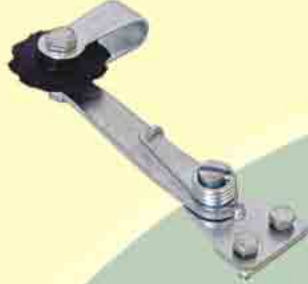
M-1641 Steel PGT/MBK