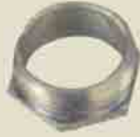
M-1596 Silencer Nut