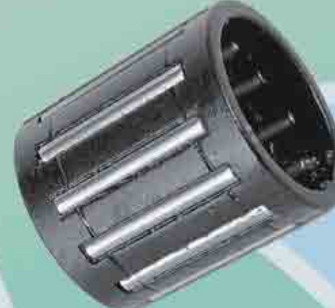
M-1706 Clutch Bearing MBK