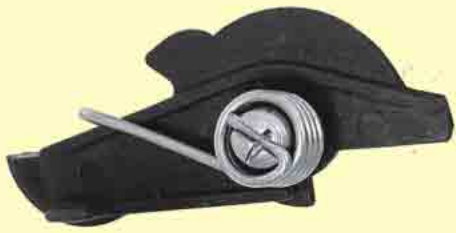
M-1636 Plastic MBK