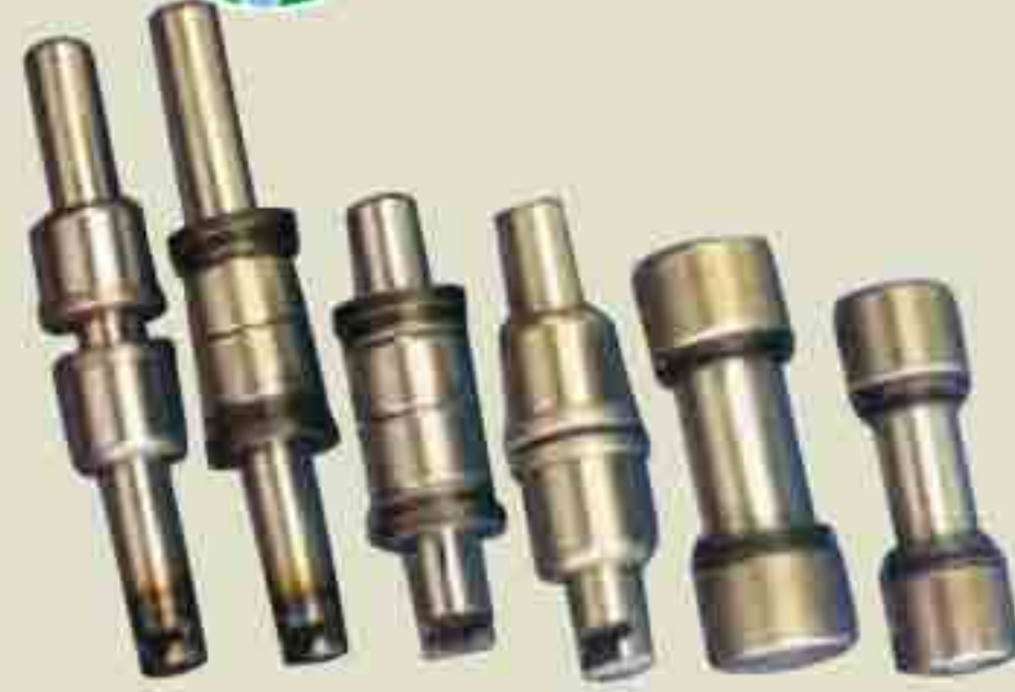
M-1601 Pivot Pins