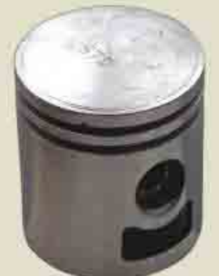
M-1781 Piston with Rings & Pin