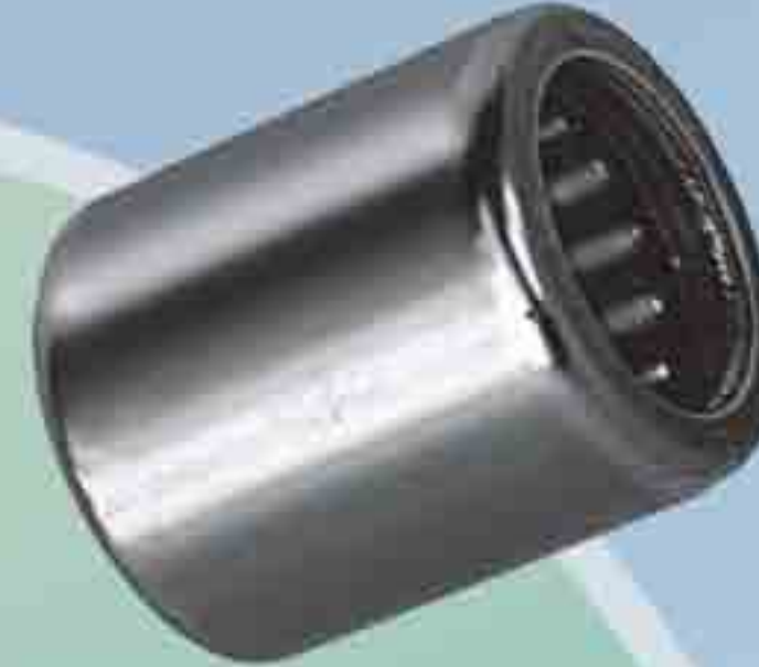
M-1702 Clutch Bearing PGT/MBK